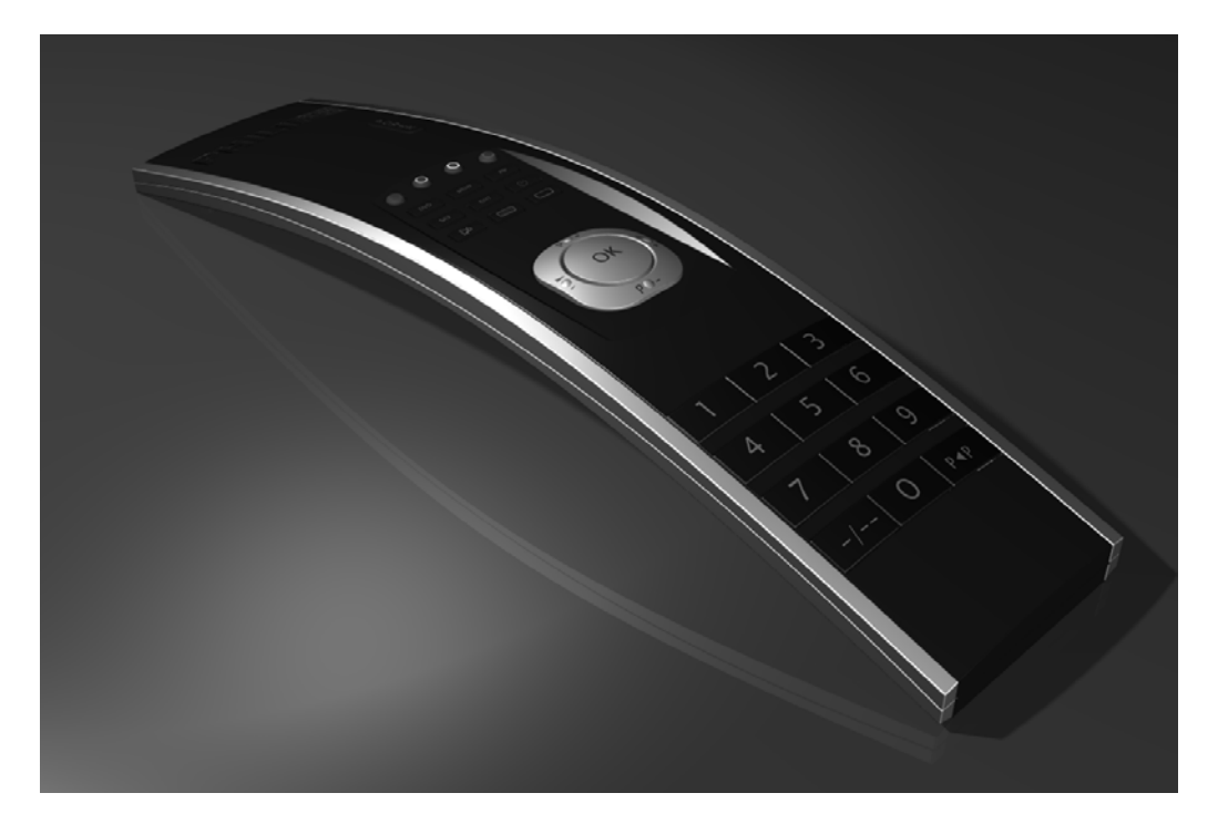
Figure 1. Remote control modelled and visualized by a student

The aim of this paper is to show how a systematic grading procedure was tested for assessment of student's works in 3D-art. We also want to investigate whether it is possible to systematize grading based on subjective assessment and compare the grade distribution in previous courses with the outcome of a systematic grading procedure (SGP).