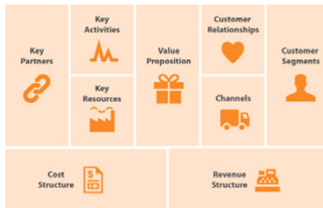
Figure 2 Business Model Canvas [20]

In order to facilitate the cross-organizational discussions on business model innovation it is often an advantage to be able to visualize the current or future business models. One such idea on how to visualize the business model is the popular Business Model Canvas by Osterwalder & Pigneur [19]. As can be seen in figure 2 the Business Model canvas contains many similar elements compared to the Doblin Innovation Model [10].