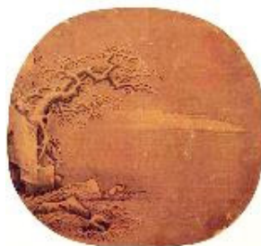
Figure 1. The source object (38.9cmx80.6cm), adopted from [Angling snow on frozen river n.d.]