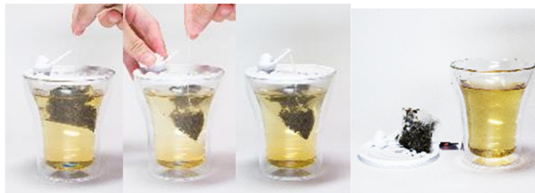
Figure 3. Use of the tag bag holder lid