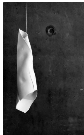
Figure 3. Example of development ceramic prototypes

His final design (Figure 4) was judged by subject specialist academic staff to be much more aesthetically pleasing than the earlier versions and has a pure, elegant, almost art like quality to it. However, it is important to note that this is a functioning product that was carefully and tested and two of them (with loudspeaker drive units installed) performed very well as stereo loudspeakers at his final