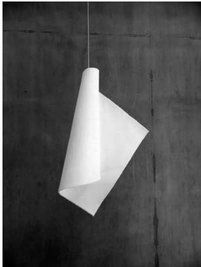
Figure 4. Final Prototype

year exhibition (Figure 5). It was also refreshing to finally see a product design student in the school explore materials beyond the ubiquitous use of plastics and occasional use of aluminium that are normally considered appropriate for contemporary consumer product design.