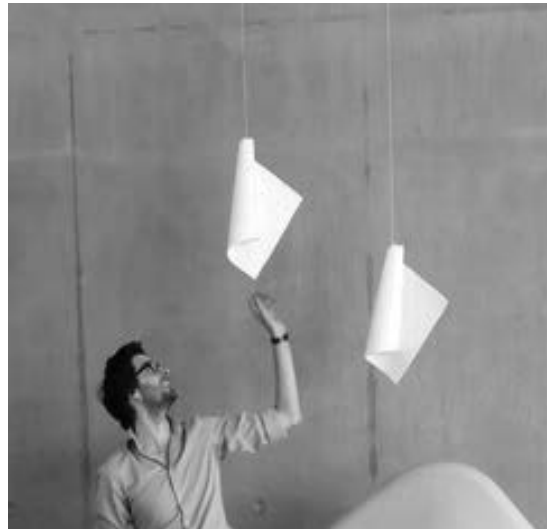
Figure 5. Final working prototype loudspeakers