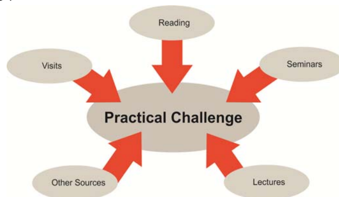
Figure 2. The Project Structure; Reframing the Assessment Task

The project was set as the core (25%) assessment assignment for Semester B of a one year module in the second year of a three year degree programme. As such, it referred to and expected students to