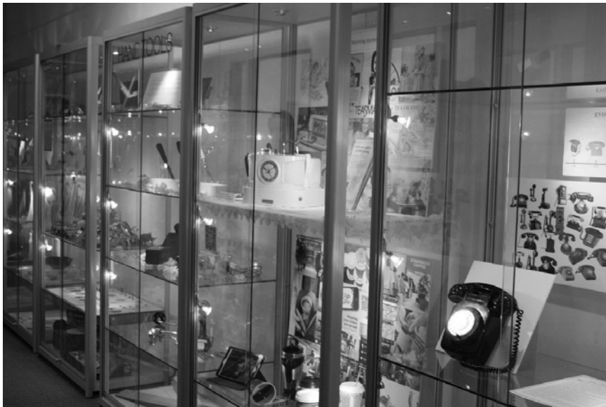
Figure 4. The Displays

The nine finished displays were assessed by a team of tutors and curators from the Museum and by peer assessment in project groups. The six best outcomes were chosen for public exhibition during Degree Show Week (Figure 4). The Us in Museum was marked as a group project, with individual mark variations based on the anonymous peer assessments and the individual Literature Review.