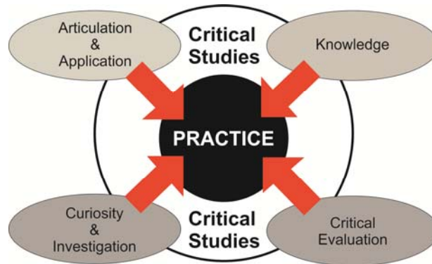
Figure 1. Relationship between Cultural Studies and Design Practice

This paper describes a collaboration between the Creative Design programme at UH and St Albans Museum. The project, described below, explores ways of better engaging design students in the academic strand of the course. One approach is to find fresh ways of addressing theoretical aspects of study by taking the work out of the lecture room and exploring the same concepts through practical activity, which utilise the analytical processes taught in the classroom. Intrinsicly linked to this approach is the perceived need to engage all students in a reflective process of design in which theoretical, social, cultural and historical aspects are embedded in studio practice (Figure 1).