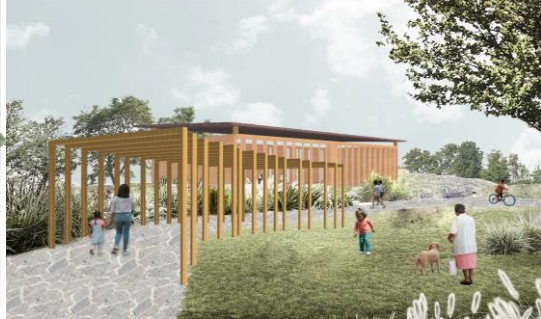
Figure 2. A-Puente and Women's plot concepts. Credit:CDR students cohorts